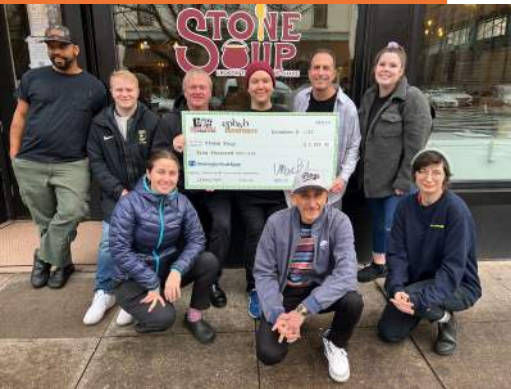
BFF and EPB&B with a matching gift donation to Stone Soup as part of the Willamette Week Holiday Gift Guide.