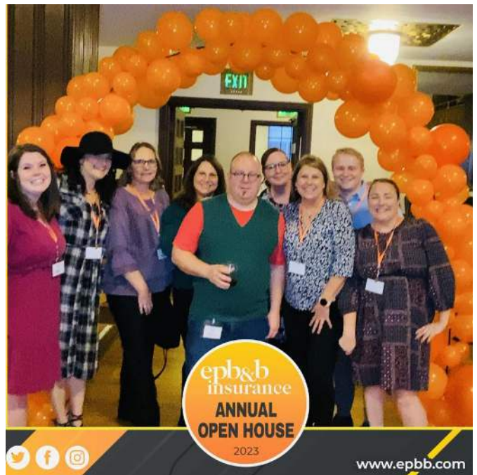
The EPB&B team celebrating a successful 2023 at the Annual Open House at the Tiffany Center, raising over $40,000 for local nonprofits, Loving One Another and Howard's Heart.

We are extremely grateful for the continued opportunity to network with our industry partners and vendors while raising much-needed money for our local nonprofits. •